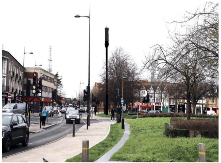
Position of proposed mast and how it would look

Position on map: https://maps.app.goo.gl/7EyW4NrKcR4ov88q9