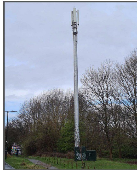
Mast to be replaced